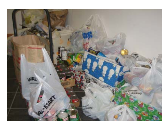
Food collected at city hall by the Arts Council

The T Minus 5 Christmas concert was excellent and provided a great family event for all those that attended.